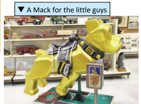
▼ A Mack for the little guys