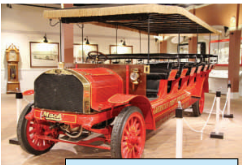
▲ America's first bus, c.1900

The restoration on some of the older trucks was fantastic and, given the size of them, must have taken quite a while. Some of the trucks are owned by the museum and others are on loan for display. All of the trucks run, including the chain drive models. There was a Mack Bulldog to ride, but all of us older kids were over the weight limit (remember, the difference between men and boys is the price of their toys). There were several rooms with different trucks in them, including an anechoic room — the one with the triangles coming out of the walls and ceiling to deaden sound. A good time was had by all. Thanks for making the arrangements, John!