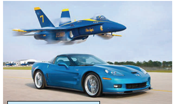
▲ (top) 1993 ZR1 Spyder, (above) 2009 Blue Devil

Portions of this article were taken from the National Corvette Museum e-News , 2/12/2014 & 2/13/2014.