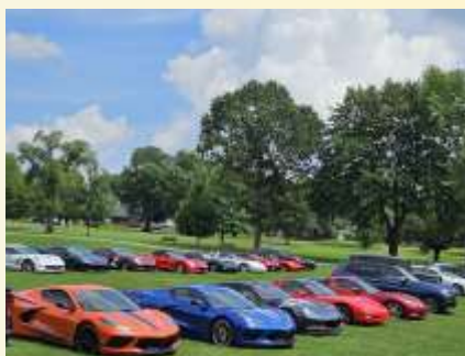
"Field of Dreams"

WHAT: broasted chicken, pulled pork, sausage sandwiches, hot baked beans, macaroni salad, potato salad, ring bologna, cubed cheese, pickles & olives, chips & pretzels, desserts, water, soda & beer